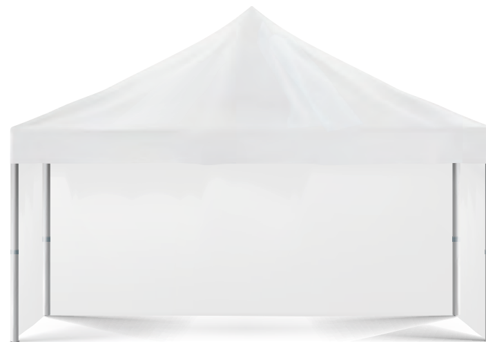
18 sqm (3m x 6m)