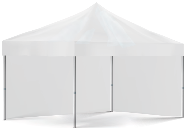
9 sqm (3m x 3m)